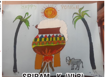
SRIRAM . K (VI-B)